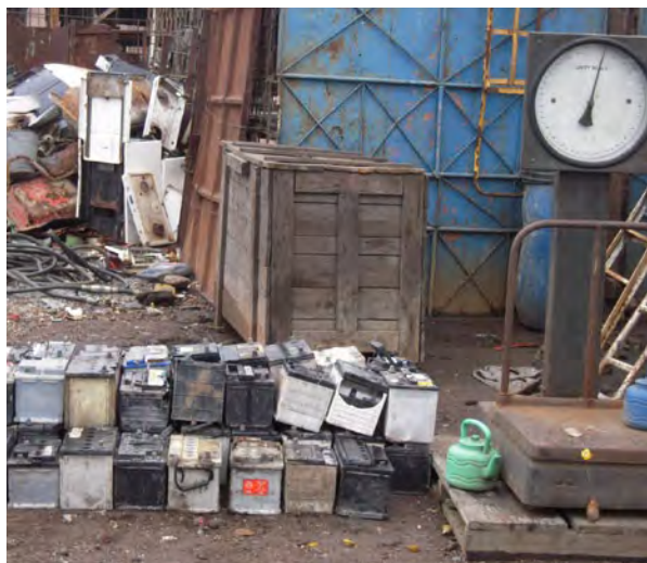
Informal used lead acid battery processing is one of the world's worst pollution problems

Current efforts include specific projects and related activities to deal with priority issues and sites, as well as technical and financial support to build the capacity of communities, governments, and industry groups to