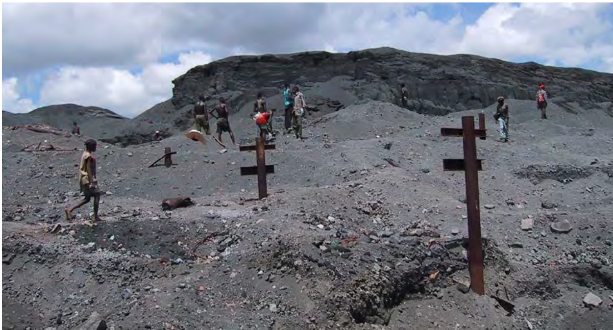
Tailings in Kabwe continue to mined artisanally