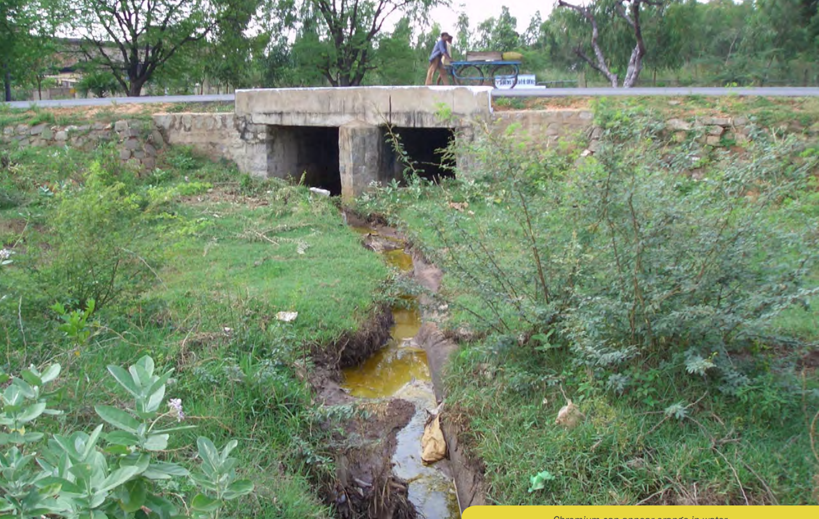
Chromium can appear orange in water