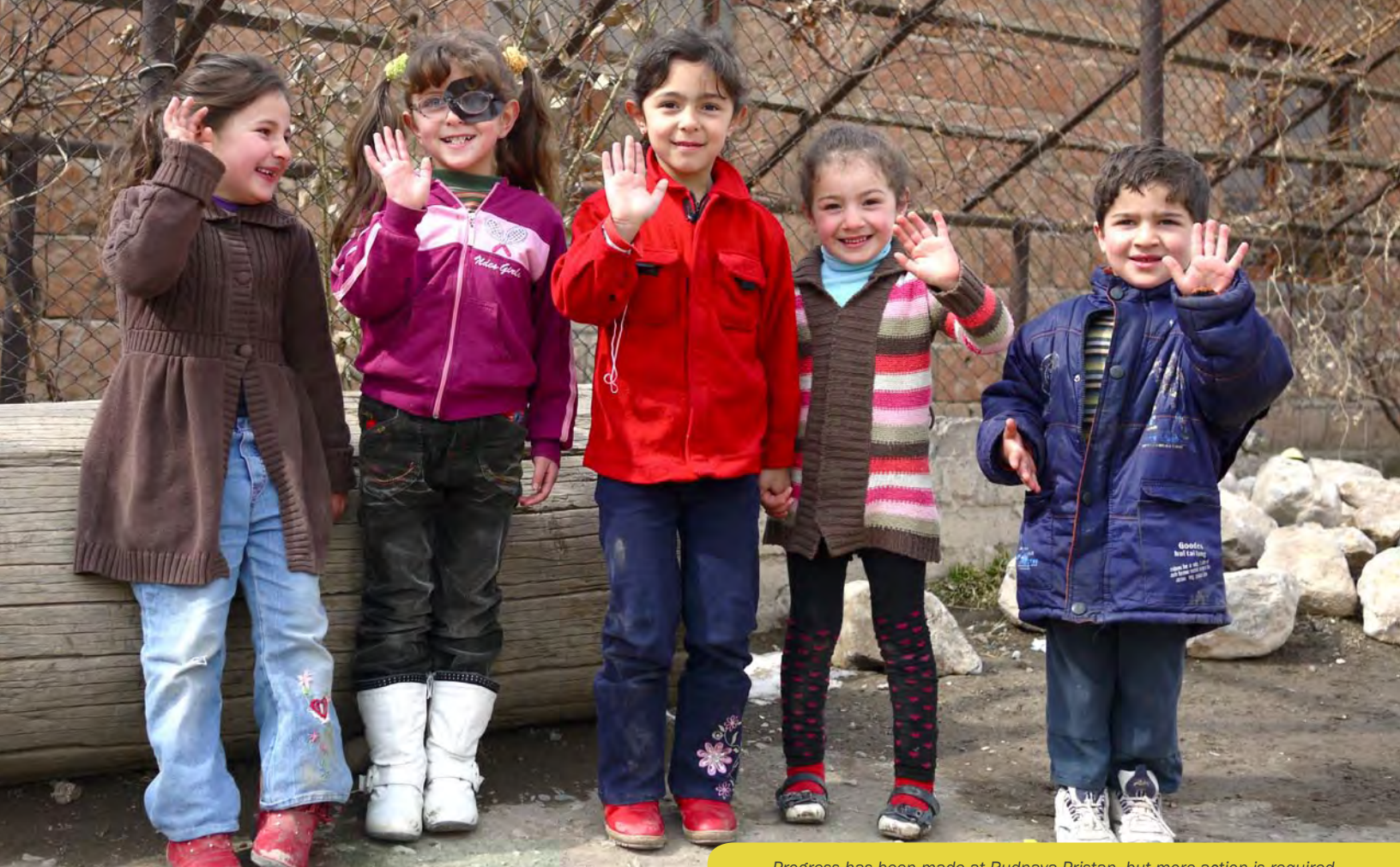
Progress has been made at Rudnaya Pristan, but more action is required

progress in dealing with pollution issues on a national level (see A Special Note on India below). The authors are hopeful that Sukinda will be addressed as part of these new programs.