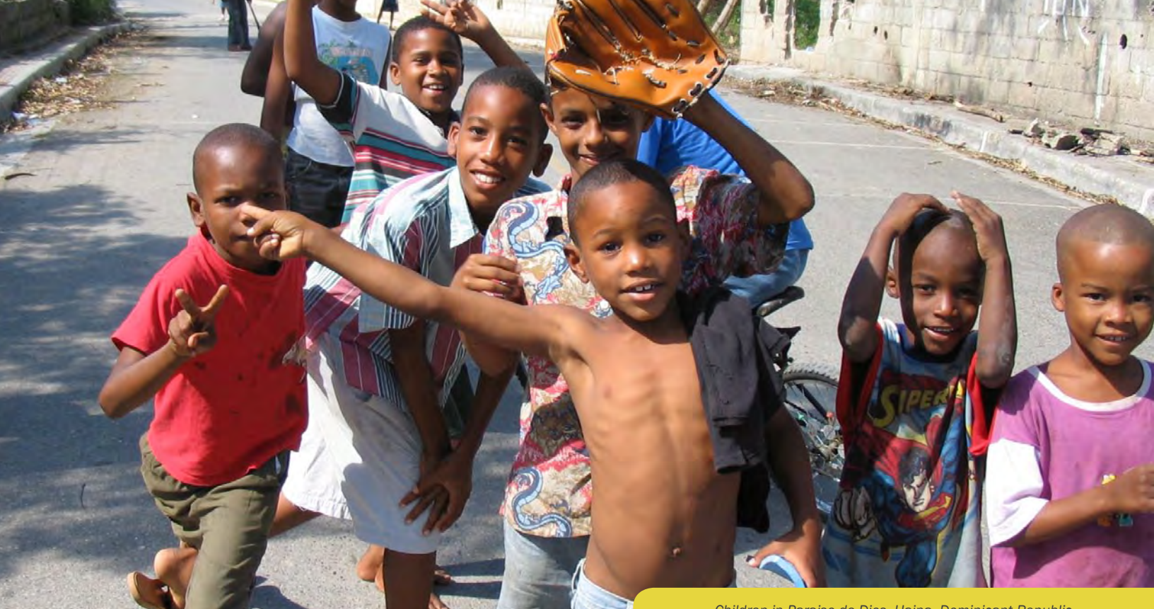
Children in Paraiso de Dios, Haina, Dominican Republic

million USD) were spent on site cleanup work, with funding mainly coming from the municipal government.