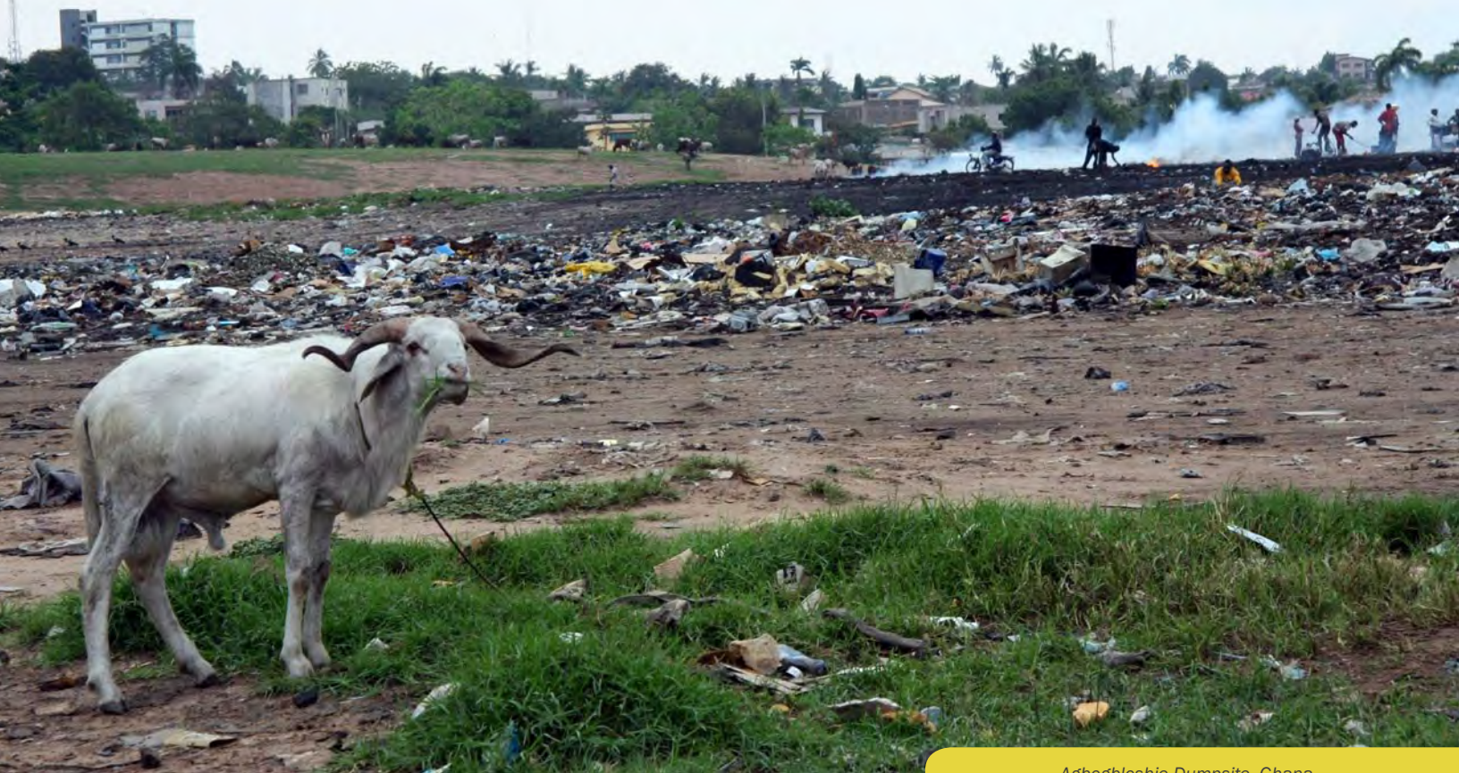
Agbogbloshie Dumpsite, Ghana

then examined the burden that toxic pollutants can put on population health in the context of the contaminated sites that are the focus of Green Cross Switzerland and Blacksmith's work. The identification and investigation of polluted sites is an ongoing task, increasingly being picked up and shared by local agencies in the countries involved. Therefore discussion of geographic regions in this report is by no means complete since it only represents sites that have been identified and are under investigation to date.