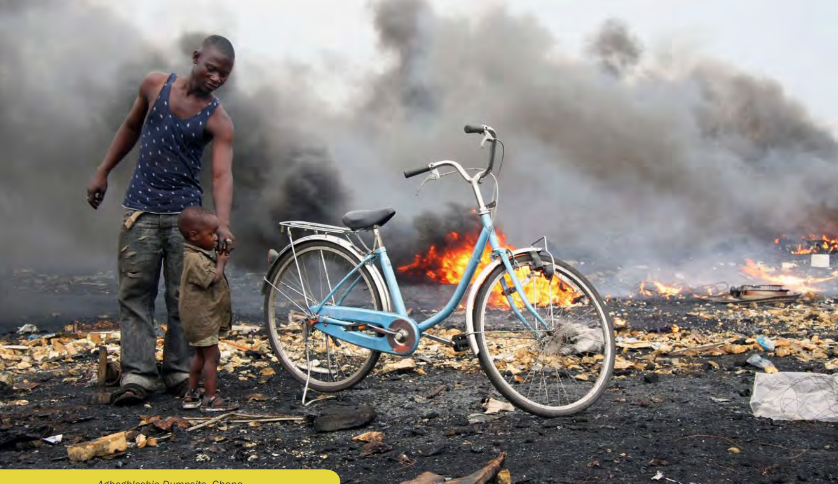
Agbogbloshie Dumpsite, Ghana

2020. Approximately half of these imports can be immediately utilized, or reconditioned and sold. 2 The remainder of the material is recycled, and valuable parts are salvaged.