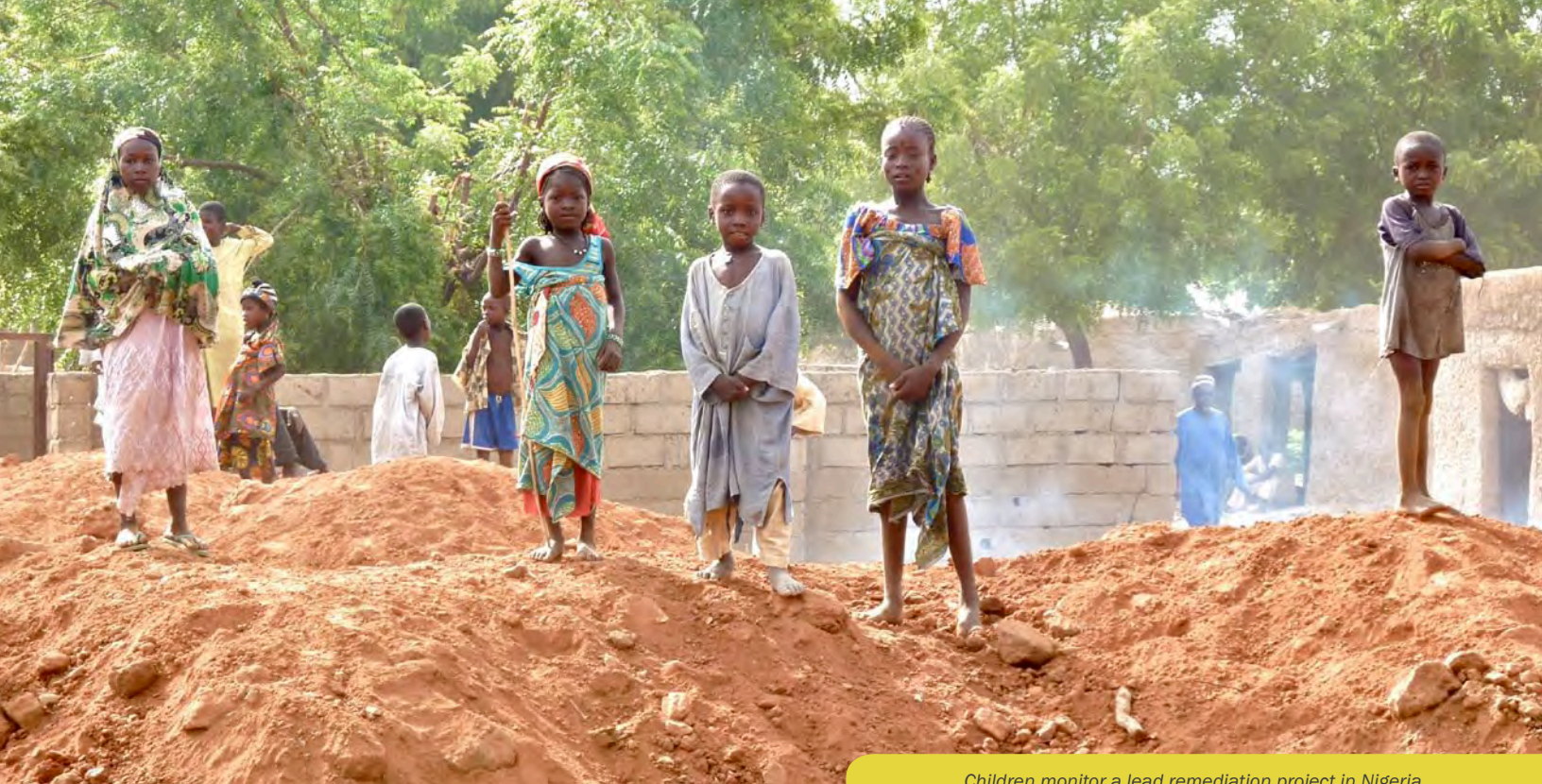
Children monitor a lead remediation project in Nigeria