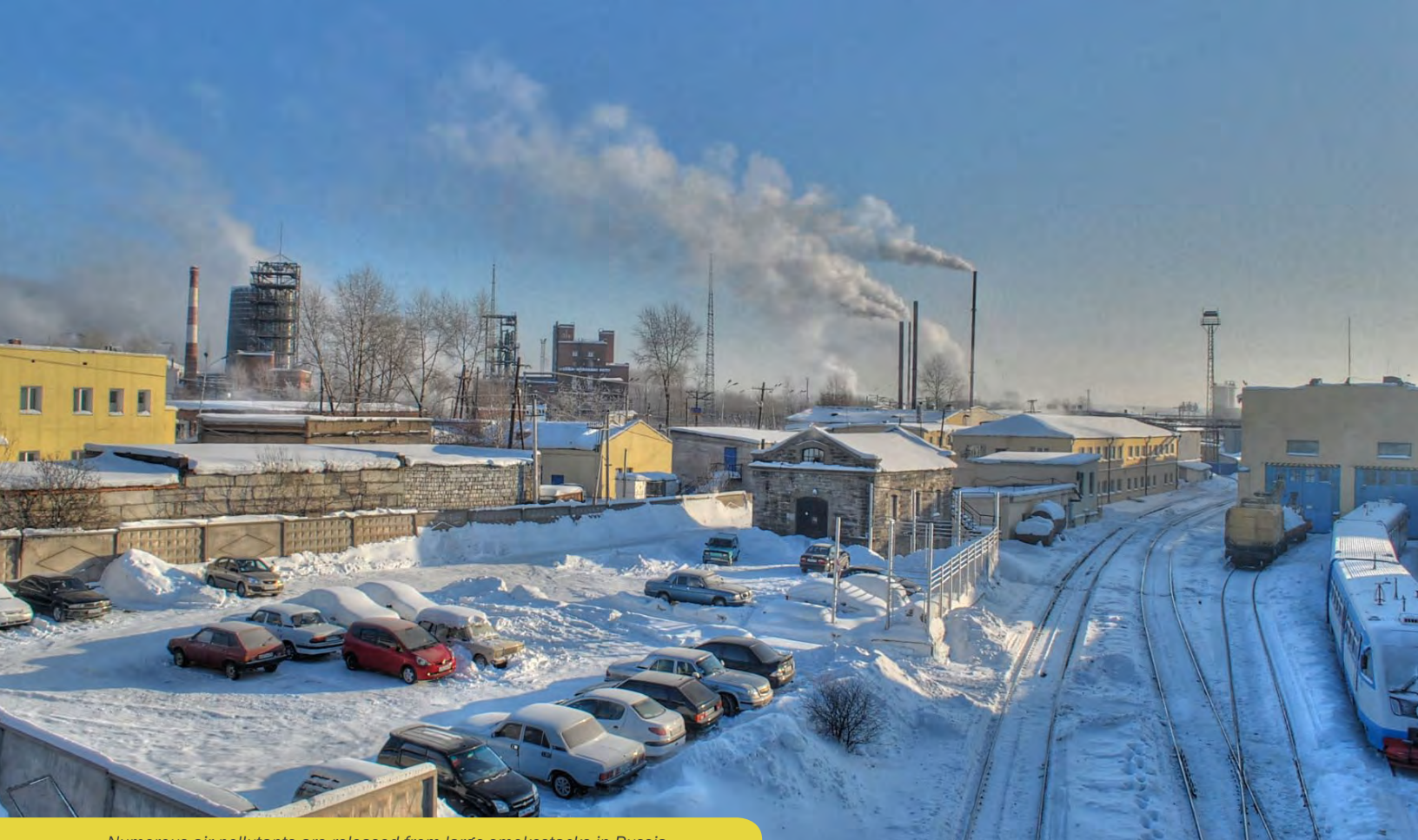
Numerous air pollutants are released from large smokestacks in Russia

were still employed in factories that produce toxic chemicals at the time our 2007 report was published. In 2003, the death rate was reported to exceed the birth rate by 260%, and the city's annual death rate (17 per 1,000) is higher than Russia's national average (14 per 1,000). In a city of 300,000, that translates to about 900 extra deaths annually. The average life expectancy is reported to be 42 years for men and 47 for women. 74