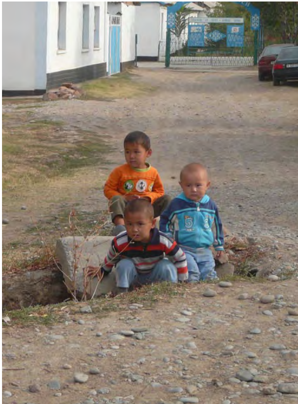
Children playing near in lead contaminated soil

Following the onsite activity, UASD, Blacksmith and TerraGraphics carried out a remedial program in the community with Inter-American Development Bank funding. The key components of this work were the construction of Gabian basket walls to limit soil erosion, removal of highly contaminated waste, and covering of contaminated soils with a concrete layer. This work was implemented in August 2010. Blood tests taken in September of the same year found an average BLL of 12.6 µg/dL (range 4-46 µg/dL), or