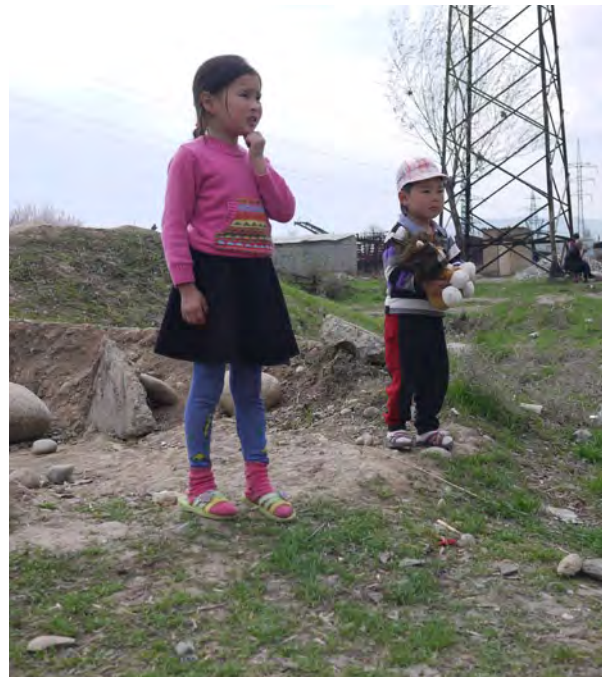
Mailuu-Suu is heavily at risk from radionuclides