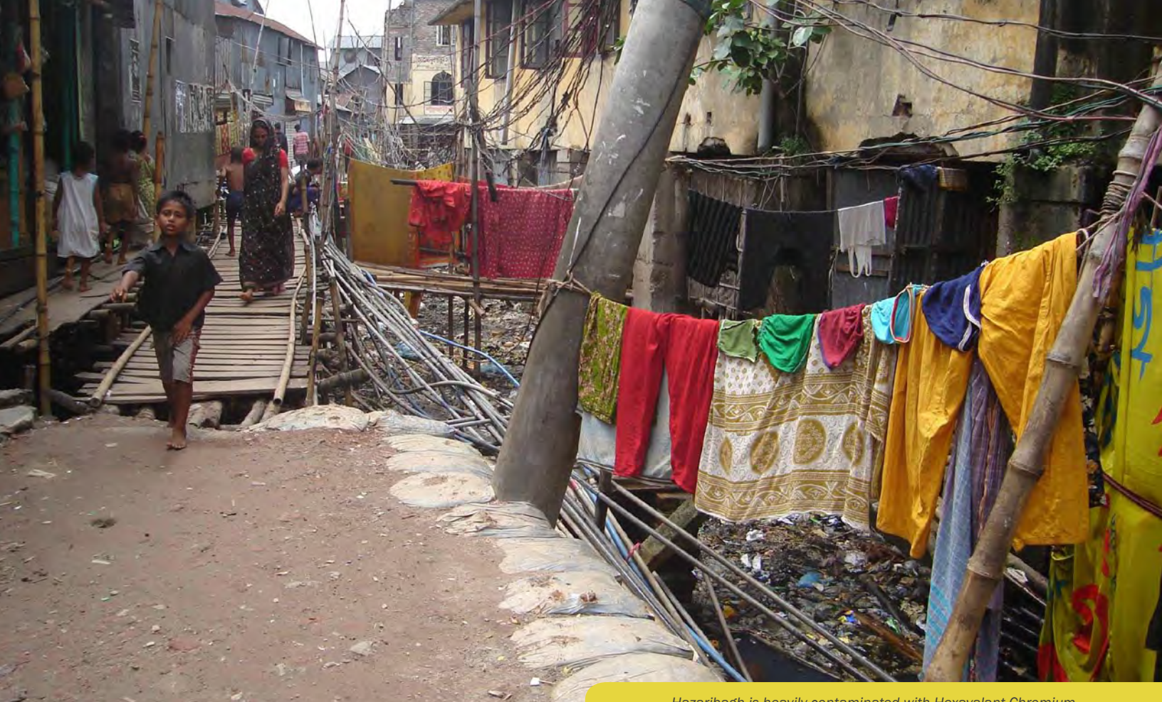
Hazaribagh is heavily contaminated with Hexavalent Chromium

A conservative estimate of the population at risk might fall in the area of 40,000 people. 5 However, a more in-depth assessment would be required to better capture the risk, which might affect as many as 250,000 people. Since 2008, Blacksmith Institute and its partner, Green Advocacy Ghana (GreenAd), have been piloting technologies to aid recyclers in replacing the burning process. Hand wire-stripping tools introduced in 2010 were met with a small-degree of success but burning remained the preferred method. Currently, project partners are working to mechanize the wire-stripping process through the creation of work stations outfitted with a variety of wire-stripping machines. These machines eliminate air pollution and centralize recycling to reduce wide-spread communal exposures. Comprehensive health and occupational safety trainings, implemented since 2008, have built the